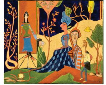
Josephine Tota Untitled , 1982 Memorial Art Gallery