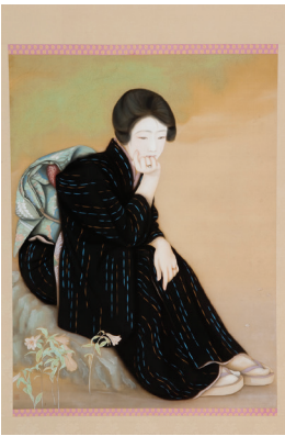
Kakiuchi Seiyō Beauty , 1925 Honolulu Museum of Art