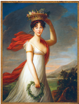
Elisabeth Vigée-Lebrun Julie as Flora, Roman Goddess of Flowers , 1799 Museum of Fine Arts, St. Petersburg, Florida