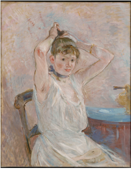
Berthe Morisot The Bath , 1885-86 The Clark