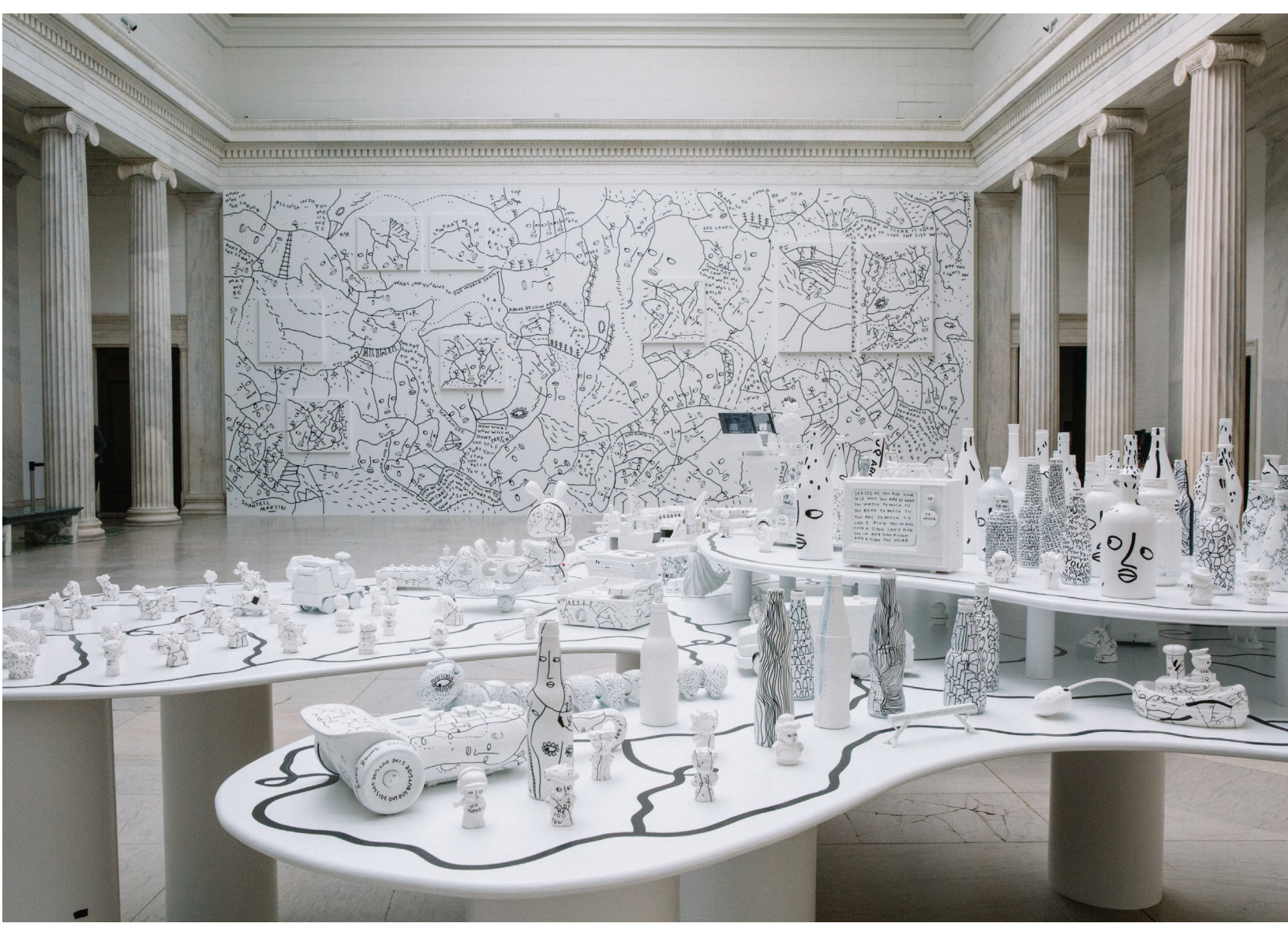
Installation view of Shantell Martin: Someday We Can (March 11–June 25, 2017) in the Sculpture Court of the 1905 Building. Martin also created the mural Dance Everyday at 537 East Delavan Avenue as part of the Public Art Initiative.

COVER: Installation view of Picasso: The Artist and His Models (November 5, 2016–February 19, 2017) in the 1905 Building. From left: Pablo Picasso (Spanish, 1881–1973). Three Musicians , 1921. Oil on canvas, 80½ x 74½ inches (204.5 x 188.3 cm). Philadelphia Museum of Art; A. E. Gallatin Collection, 1952; and La toilette , 1906. Oil on canvas, 59½ x 39 inches (151.1 x 99 cm). Collection Albright-Knox Art Gallery, Buffalo, New York; Fellows for Life Fund, 1926 (1926.9). © Succession Picasso / Artists Rights Society (ARS), New York.