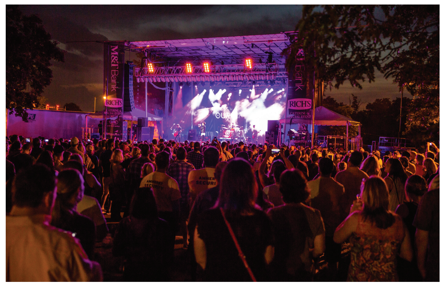
The Albright-Knox welcomed nearly 5,000 guests at Rockin' 2017, which featured Our Lady Peace and Collective Soul with special guest Tonic on June 29, 2017.