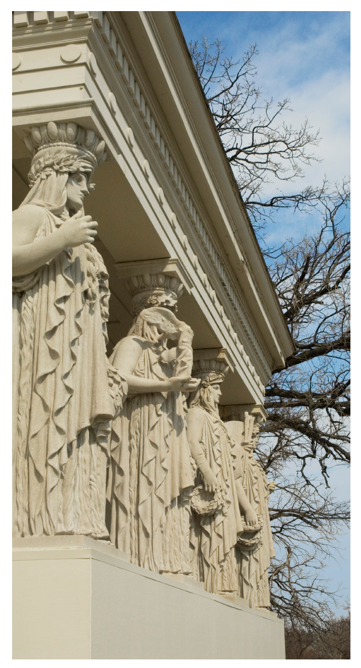
Augustus Saint-Gaudens (American, 1848–1907). Eight Caryatid Figures , 1906–07. Marble, each 102 inches (259.1 cm). Collection Albright-Knox Art Gallery. James G. Forsyth Funds, Albright Art Gallery and the City of Buffalo, 1933.