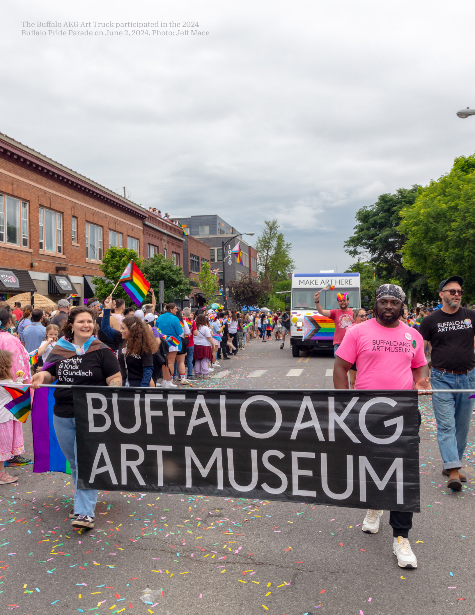
The Buffalo AKG Art Truck participated in the 2024 Buffalo Pride Parade on June 2, 2024.