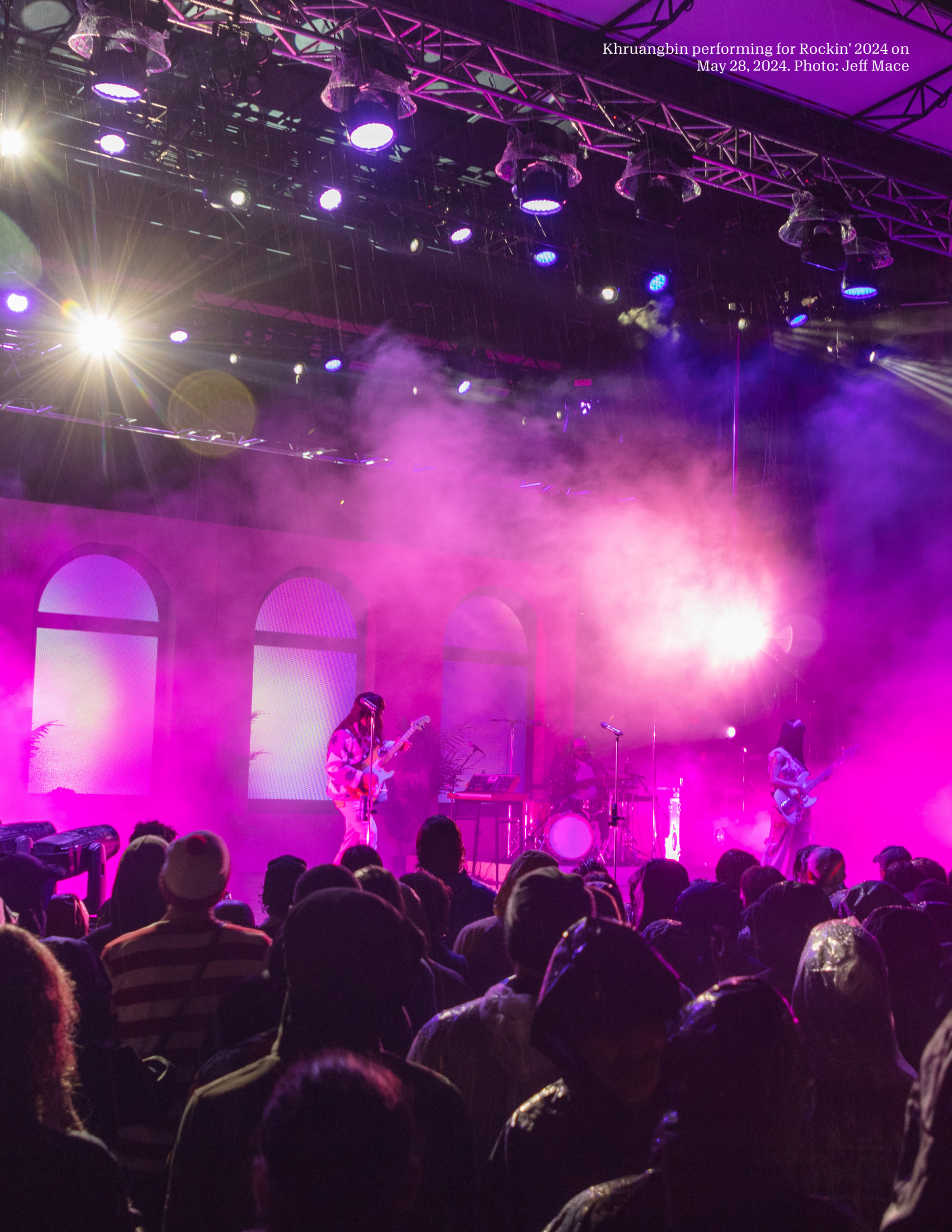
Khruangbin performing for Rockin' 2024 on May 28, 2024.