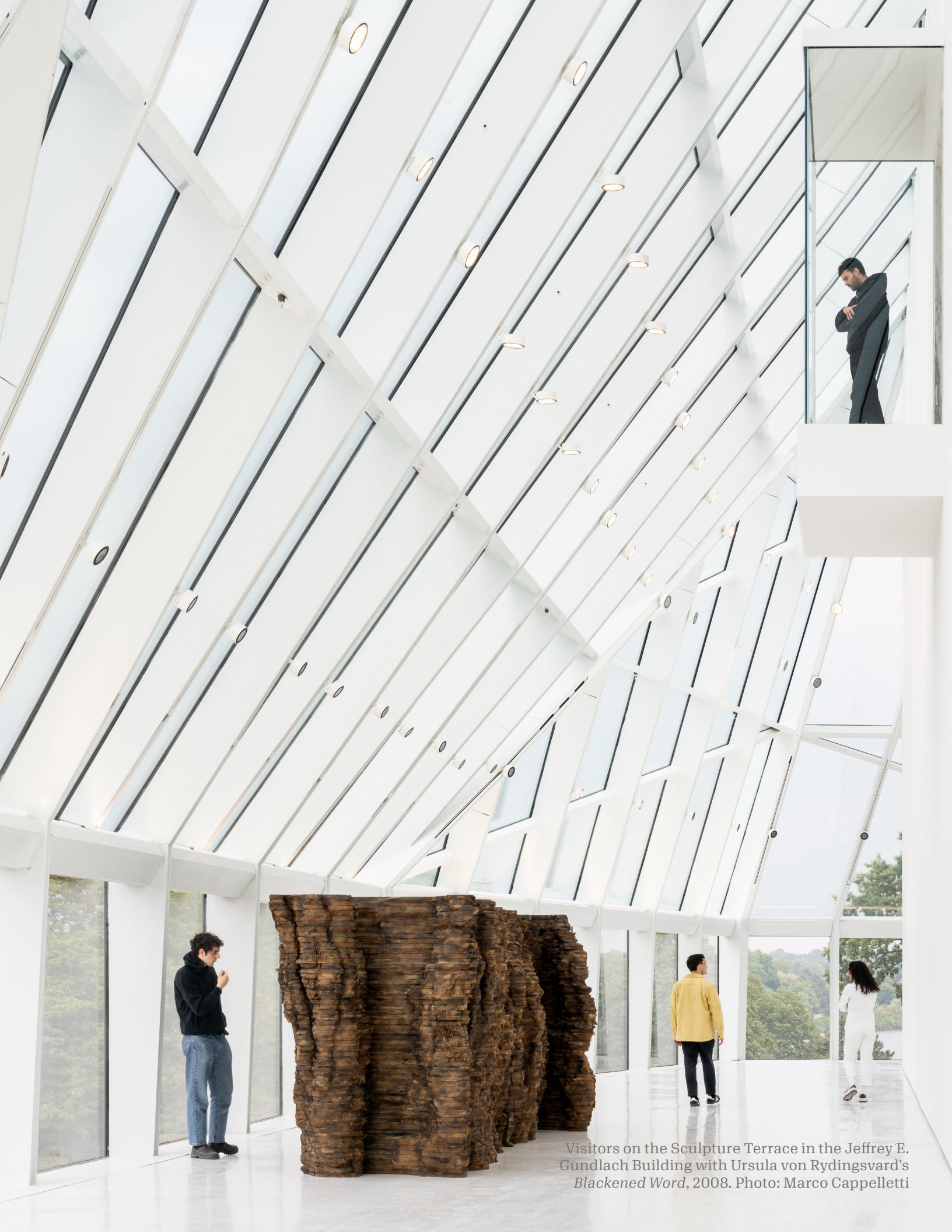
Visitors on the Sculpture Terrace in the Jeffrey E. Gundlach Building with Ursula von Rydingsvard's Blackened Word, 2008.