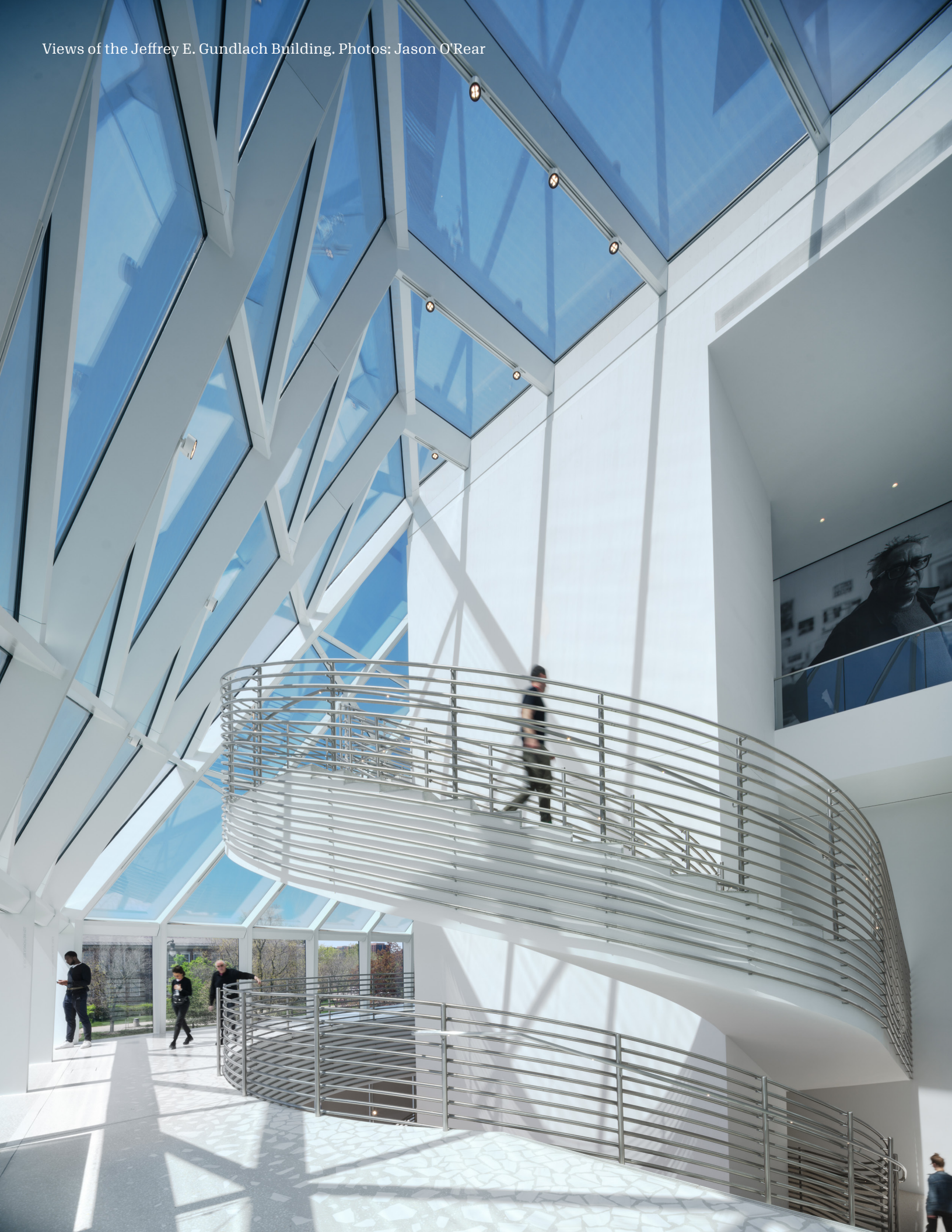
Views of the Jeffrey E. Gundlach Building.