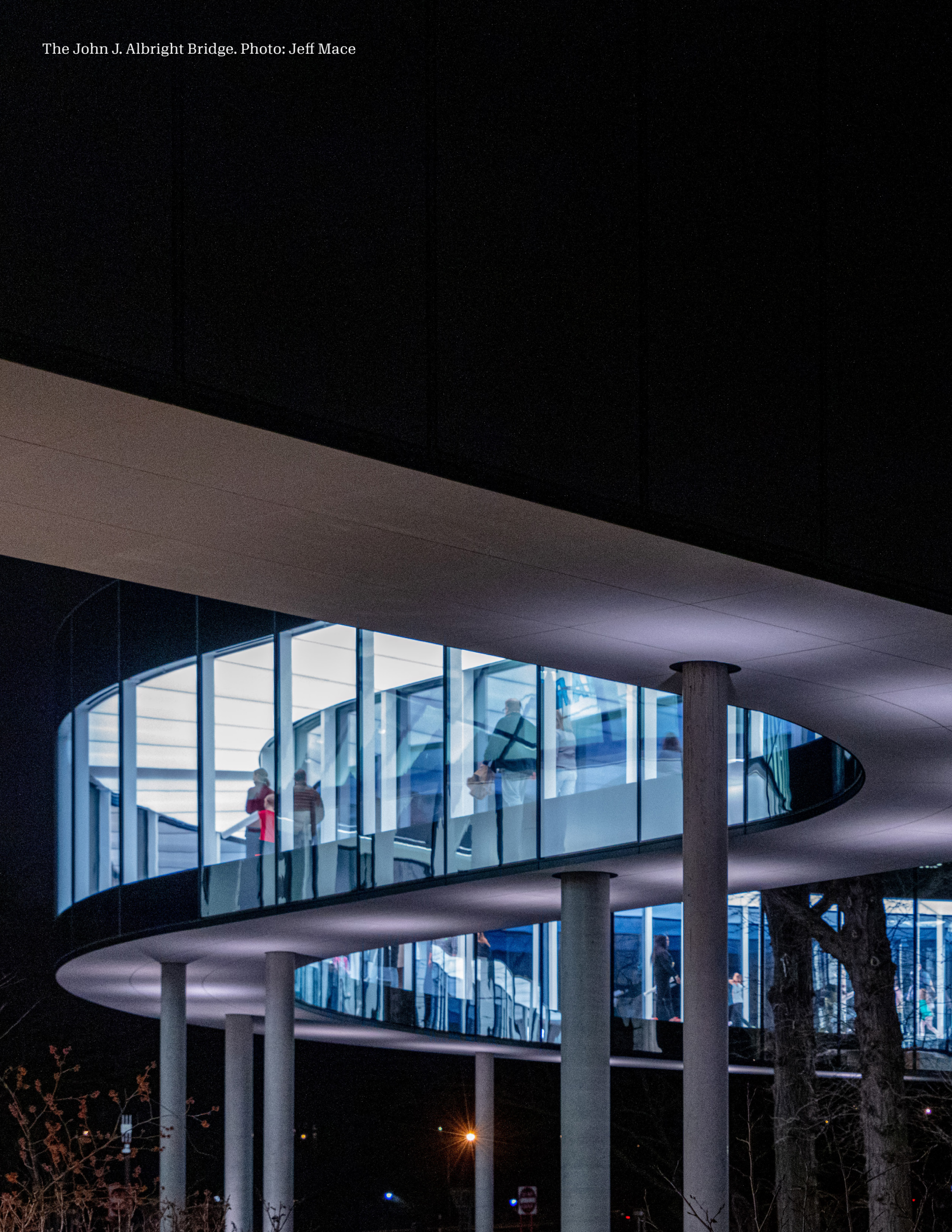
The John J. Albright Bridge.