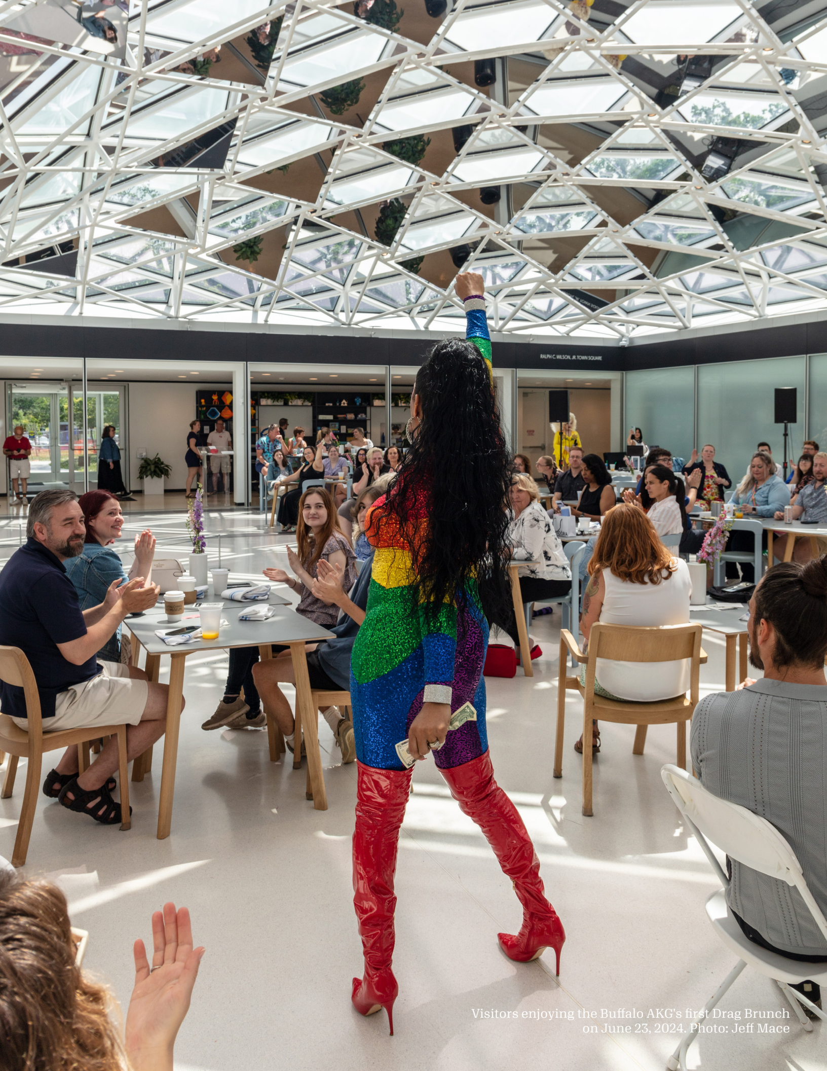
Visitors enjoying the Buffalo AKG's first Drag Brunch on June 23, 2024.